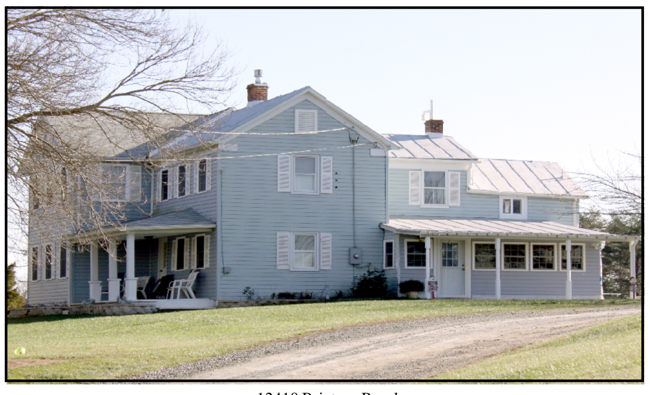
12410 Bristow Road