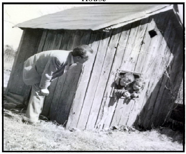
A fun time at home in Brentsville