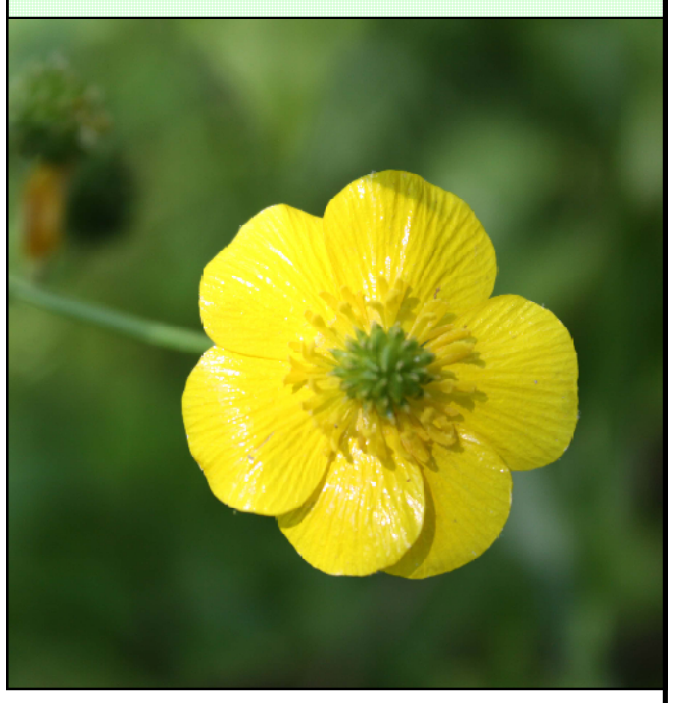
Ranunculus hispidus Michaux bristly buttercup