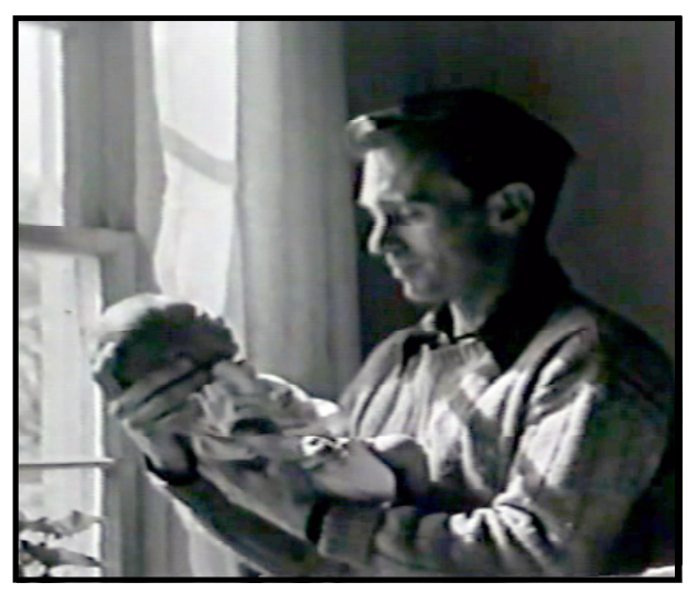
A proud father!